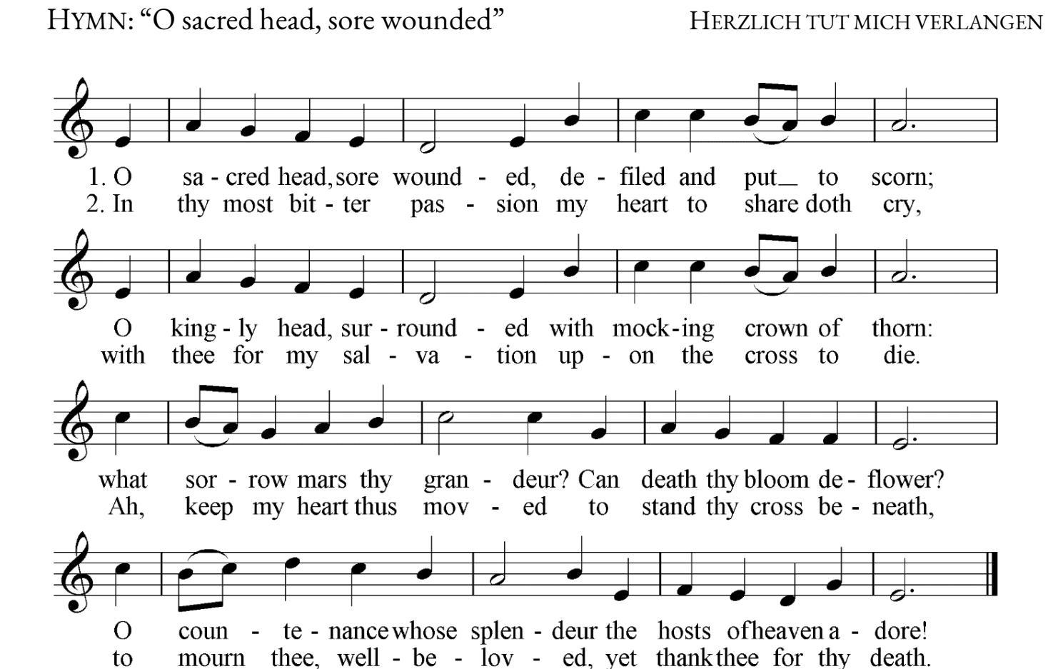
THE WORD OF GOD

All are invited to remain standing and sing, as able.