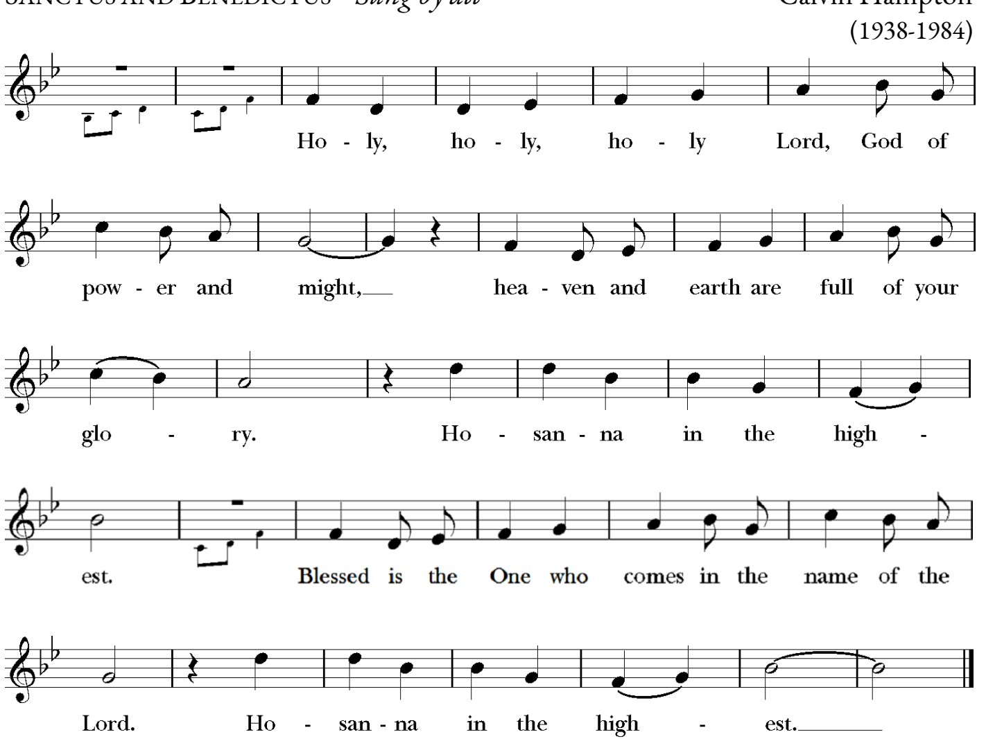
The Eucharistic Prayer continues

Blessed are you, gracious God, creator of the universe and giver of life. You formed us in your own image and called us to dwell in your infinite love.