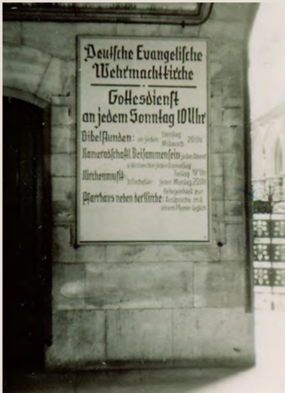
SIGN FOR GERMAN PROTESTANT MILITARY CHURCH AMERICAN CATHEDRAL ARCHIVES

on avenue Hoche, and the Protestants went to the former American Cathedral, now called the “Deutsche Evangelische Wehrmachtskirche” (German Protestant Military Church). Other American institutions, such as the American Hospital, the American Library and the American Church, placed themselves under French institutional authority in order to continue operating during the Occupation. The Cathedral had no such option; there was no French Episcopal church to cover it.