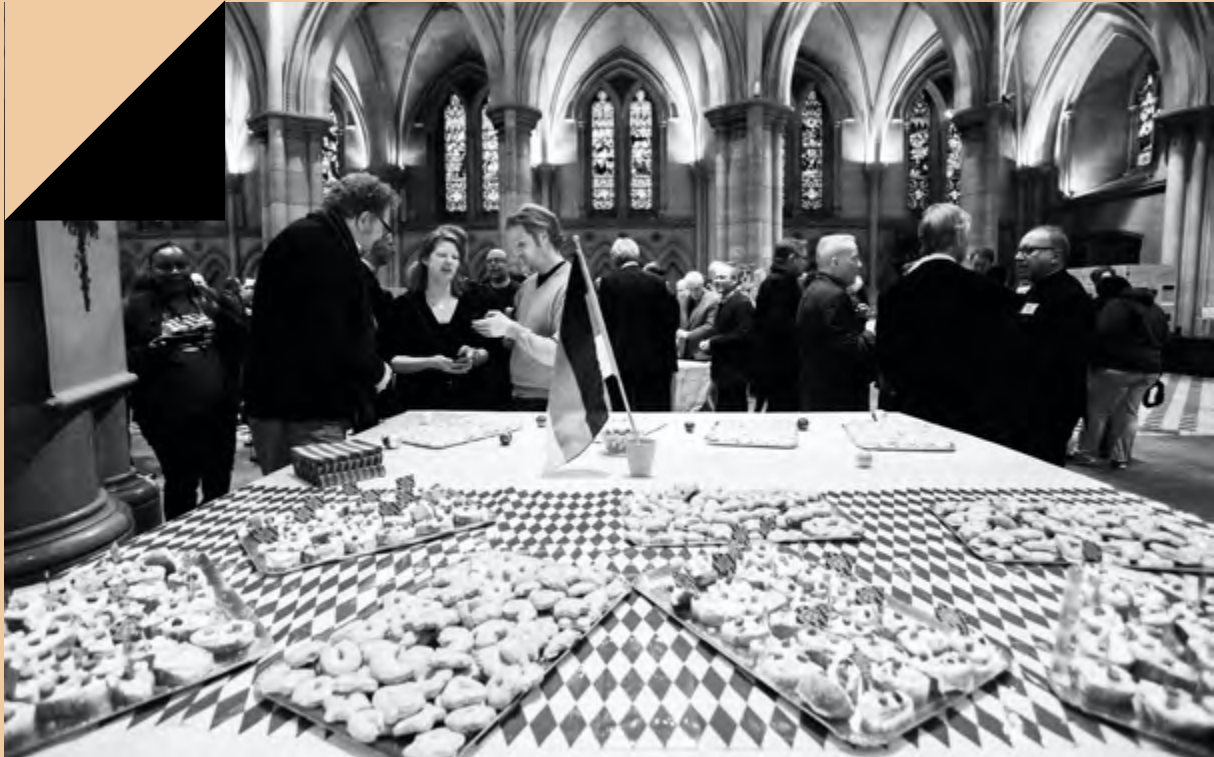
A LAVISH SPREAD FOR THE FRIDAY NIGHT FAREWELL

More than 20 committee meetings, 60 subcommittee meetings and countless email conversations across 8 nations went into the making of the 3-day celebration of Bishop Mark Edington's ordination. He is the 1,115 th Anglican bishop of the apostolic succession, 26 th bishop in charge of the European Convocation, 2 nd bishop elected and 1 st ordained at The American Cathedral of the Holy Trinity.