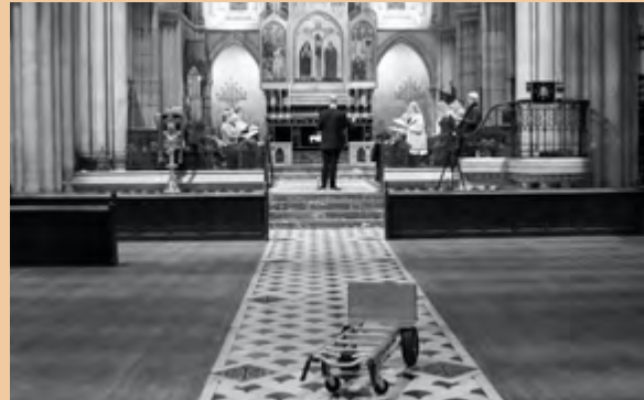
CHOIR PRACTICES TO AN EMPTY CHURCH