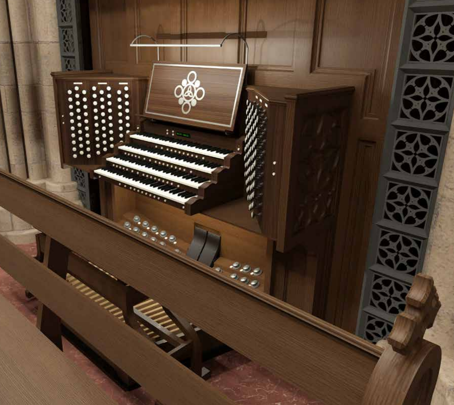
▲ Proposed new console design.

to house the chancel organ on opposite sides of the choir.